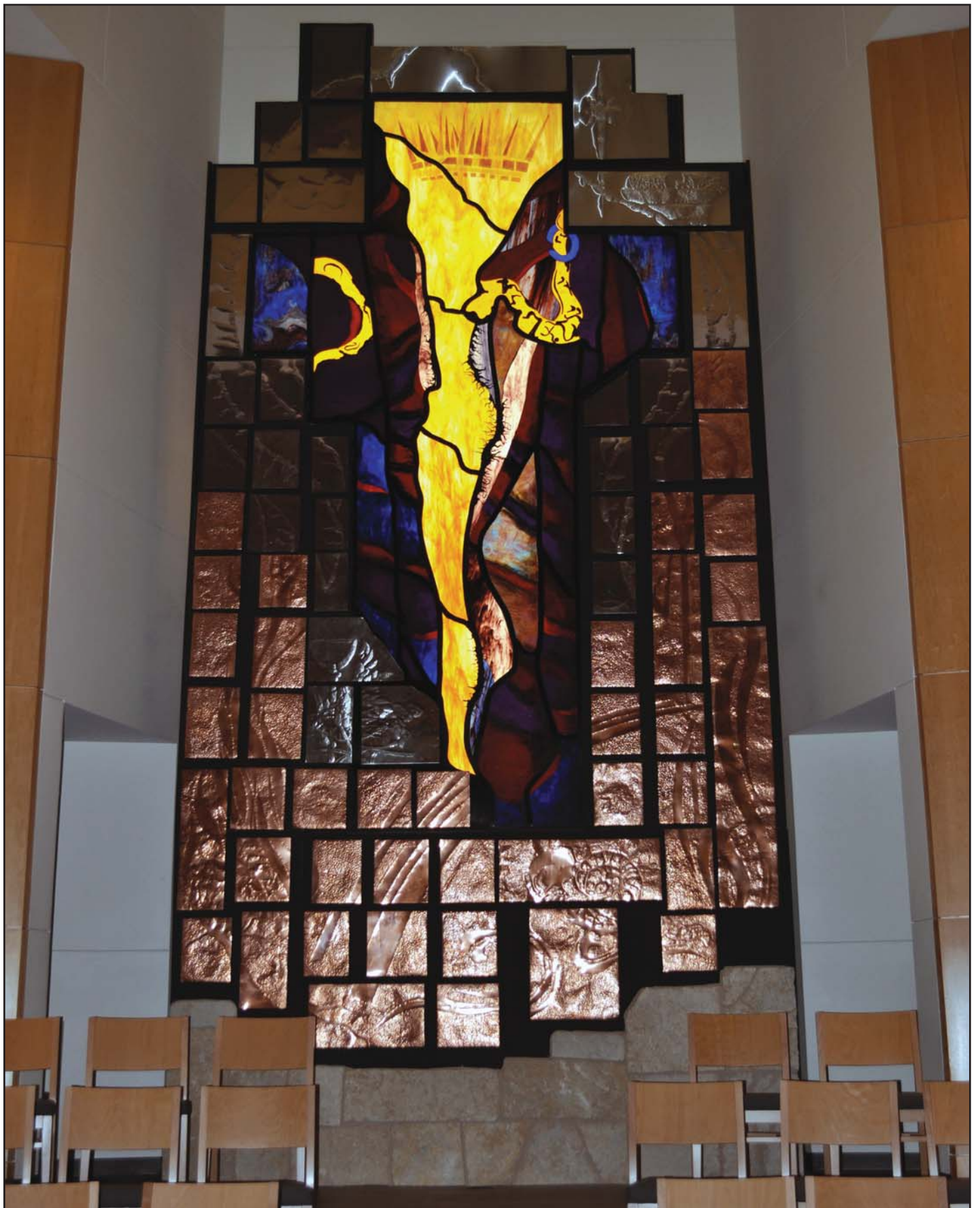
Grace Bible Church in Dallas, Texas. This free-standing wall was built in front of the rear Chancel wall. The piece is lit by a light-box behind the stained glass segment of the wall sculpture. The stained glass is symbolic of the curtain in the Temple being torn at the time of Christ's death on the cross. There are 39 hammered copper plates symbolic of the books of the Old Testament and 27 stainless steel plates that represent the books of the New Testament.