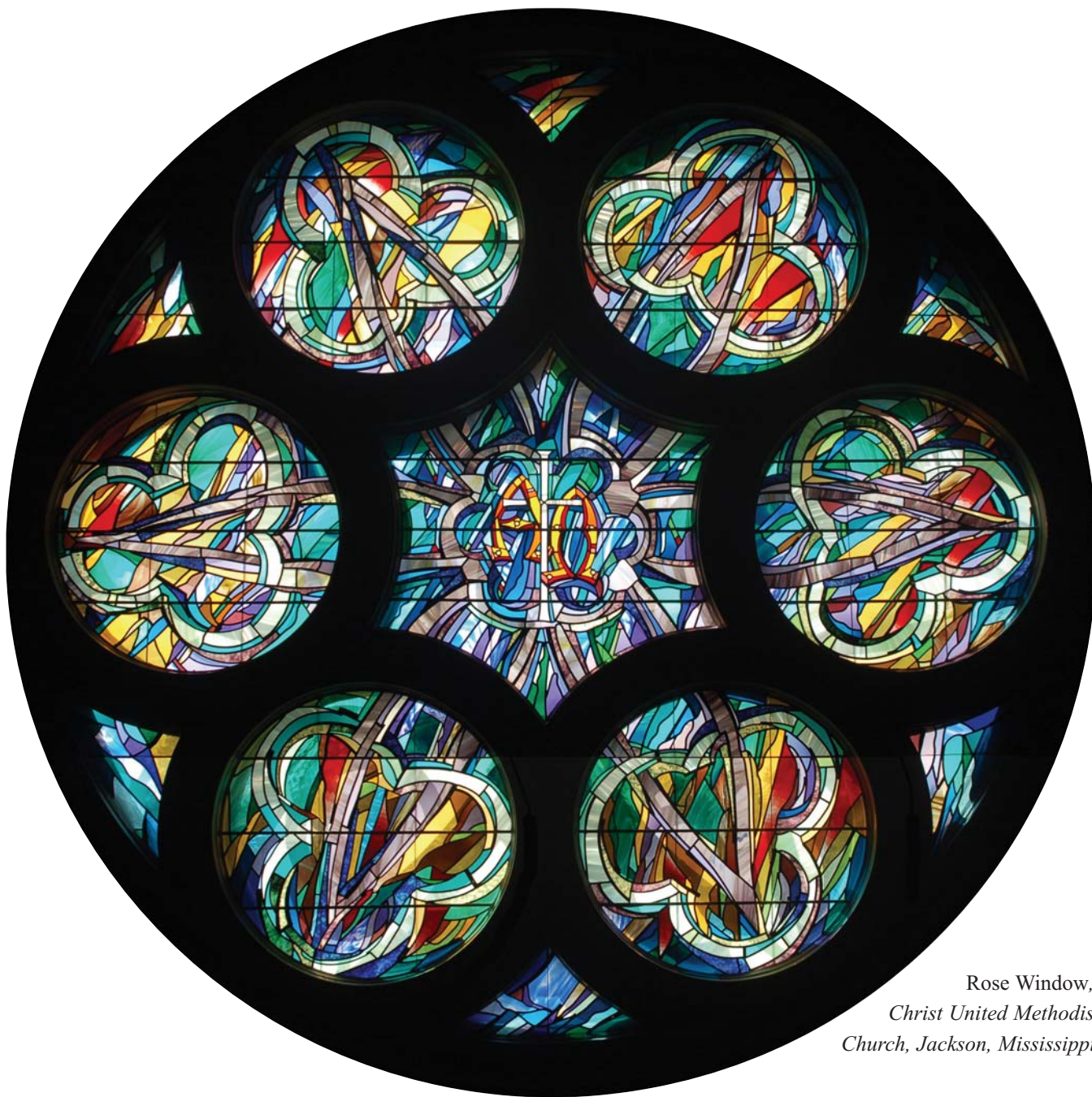
Rose Window, Christ United Methodist Church, Jackson, Mississippi

In today's rapidly changing society, the needs, desires, and questions that arise when a church considers building a new sanctuary are different than they were 20, 10, or even five years ago. One of the consistent concerns that we hear from churches today has to do with the need to accommodate multi-media pre-