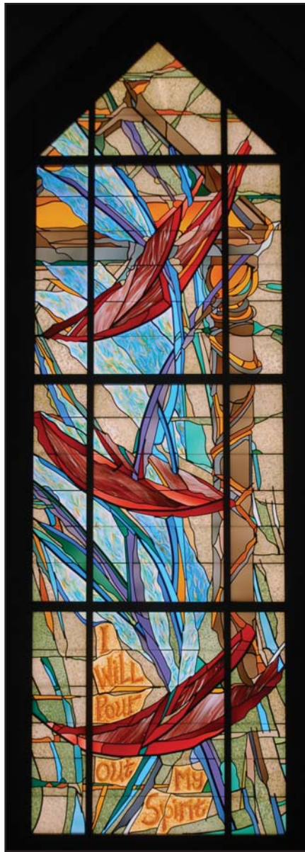
“I Will Pour Out My Spirit,” Christ United Methodist Church, Jackson, Mississippi

One specific and remarkable example of this concept is the series of “windows” that Pearl River Glass Studio built for Christ United Methodist Church (CUMC) of Jackson, Mississippi. The Studio began work with CUMC in 2003. Their new facility