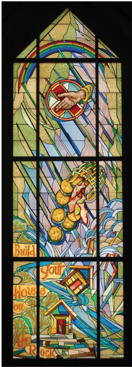
“Build Your House on the Rock,” Christ United Methodist Church, Jackson, Mississippi

that the finished result is relatively indistinguishable from a normal church window. The distinct advantage of this is that the windows can be “turned off” in order to give presentations in the sanctuary.