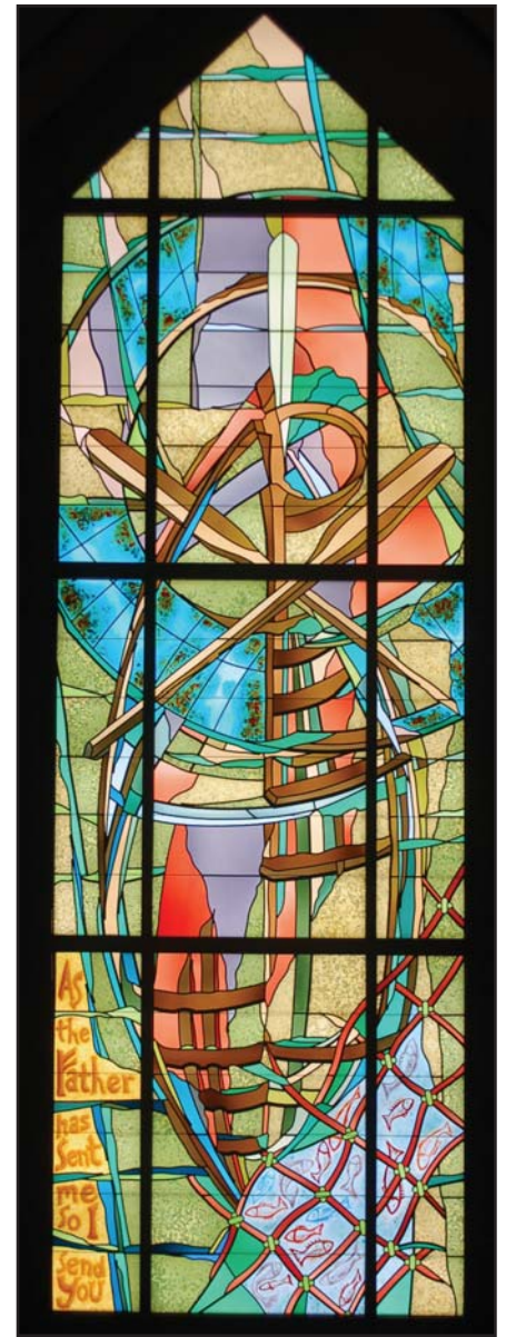
“As the Father Has Sent Me, So I Send You,” Christ United Methodist Church, Jackson, Mississippi

was designed to seat 1,500 people. Fire and safety codes for such a large space required that exit hallways surround the sanctuary. These exterior hallways prohibited the inclusion of windows on the interior walls of the sanctuary to let in natural light. The architects for the building did, however, design recessed niches into the side walls to approximate the look and feel of six large windows. Pearl River Glass Studio worked closely with the architect during the construction of the building to ensure that the